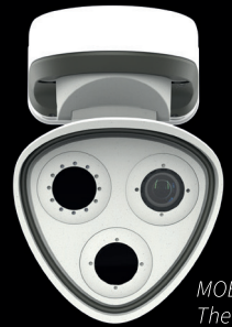
MOBOTIX M73 Thermal/TR